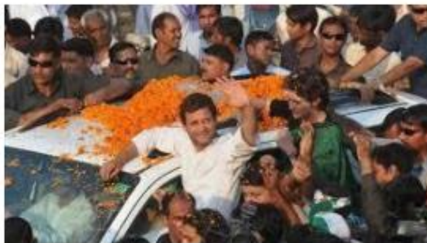
Political campaigning by the leaders of a major political party