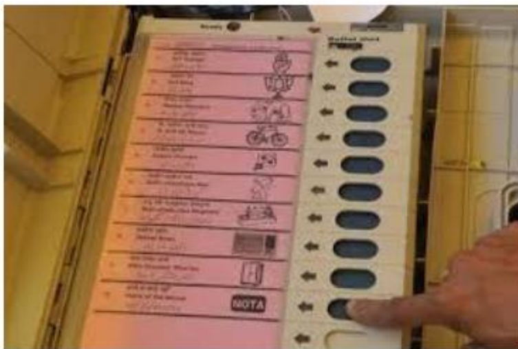
Electronic Voting Machine