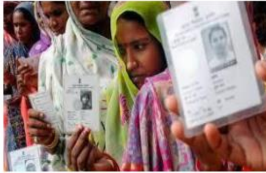
A lady showing her voters identity card while voting at the booth.